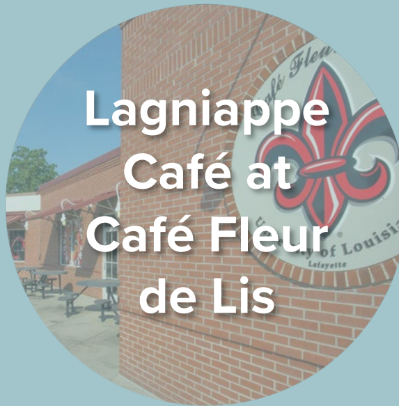
Lagniappe Café at Café Fleur de Lis