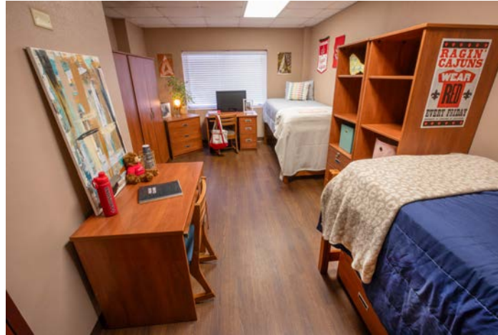
JUNIOR SUITE STYLE