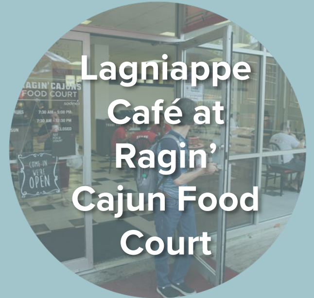
Lagniappe Café at Ragin' Cajun Food Court