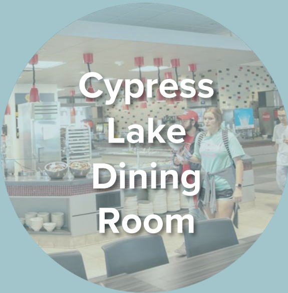
Cypress Lake Dining Room

RESETS EACH WEEK AND RUNS SUNDAY THROUGH SATURDAY