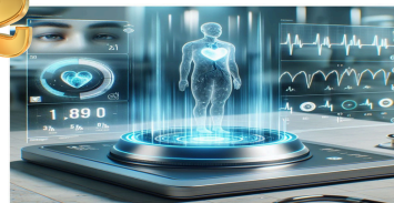
Health and safety, decoded by AI