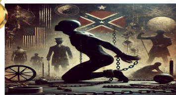
Enslaved Men's Sexual Subjugation and Supremacy

* Learn more about our Teaching Excellence Award recipients here.