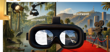
Hollywood Meets Bayou—VR Location Scouting