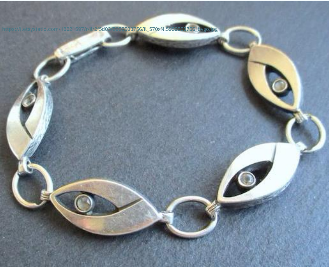
Korut- Individual pendant