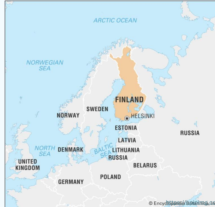
Location Map of Finland in World

https://cdn.britannica.com/41/183641-050-0EF5ECA9/World-Data-Locator-Map-Finland.jpg