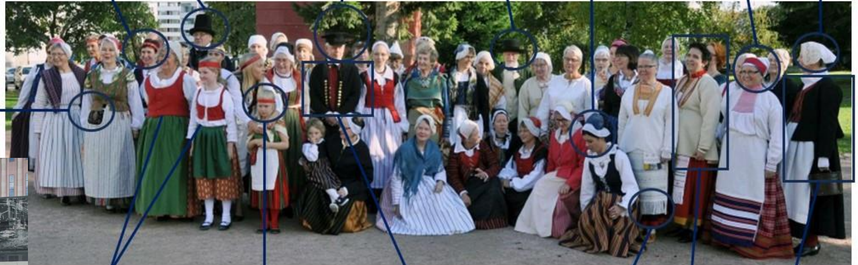
14 Two different bodice styles