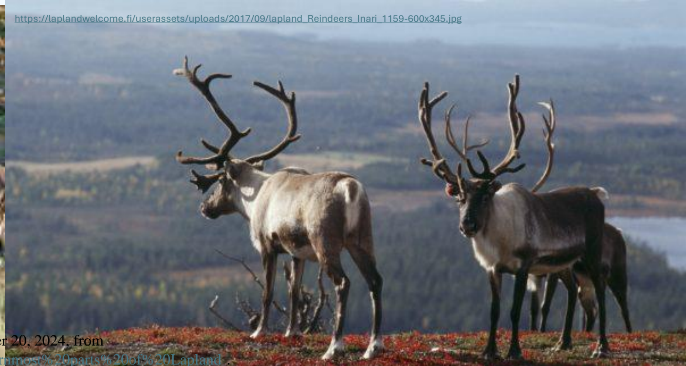
Ranuaresort. (2023, May 16). Moose - Ranua Resort . Ranua Resort. Retrieved November 20, 2024, from https://ranuaresort.com/en/elaimet/moose/#:~:text=LIVING%20HABITS,the%20northernmost%20parts%20of%20Lapland