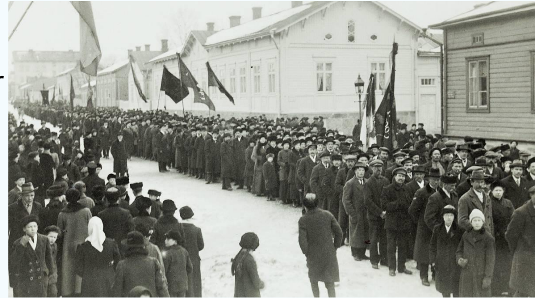
Demonstration in Turku_1917_Image_public_domain.jpg(1198x674)