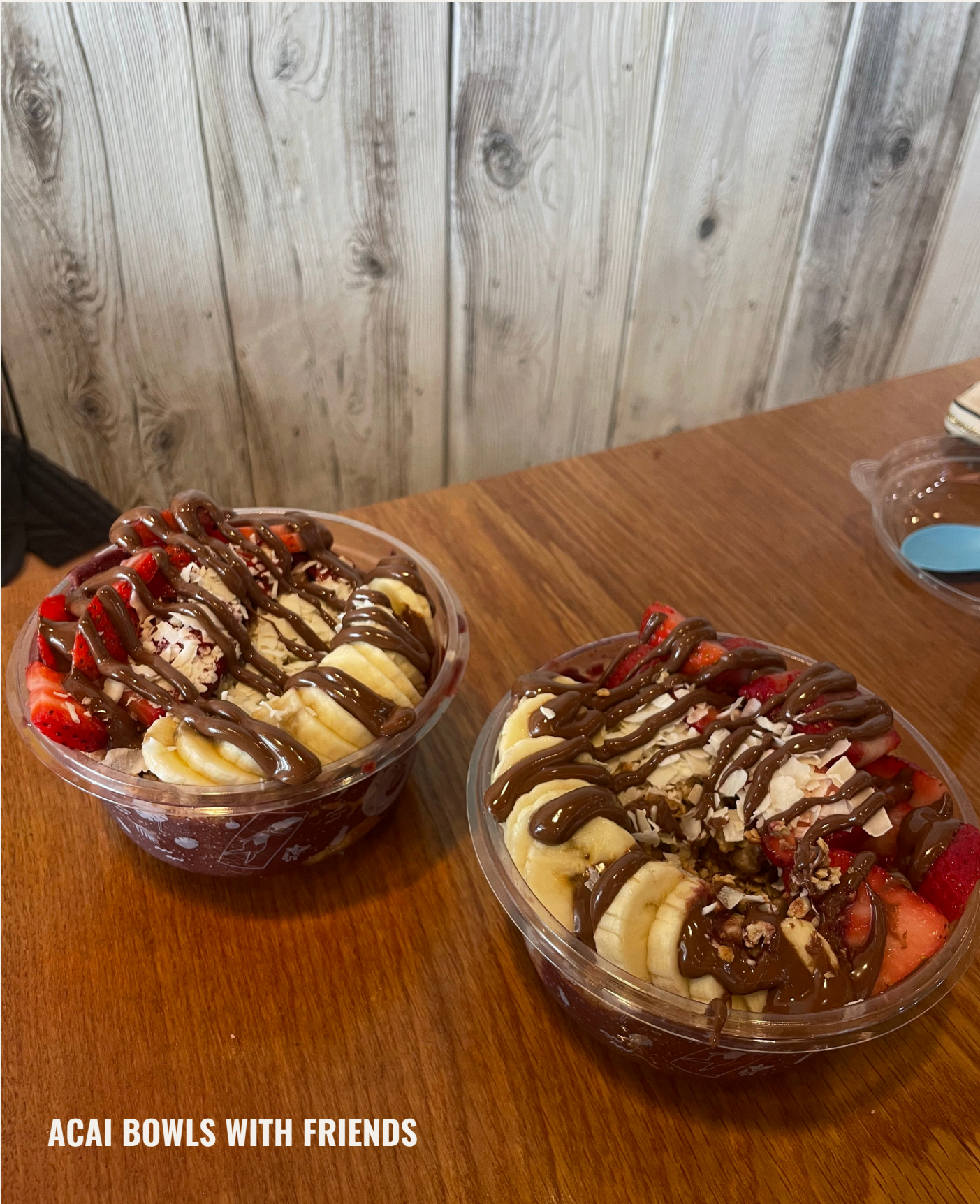
ACAI BOWLS WITH FRIENDS