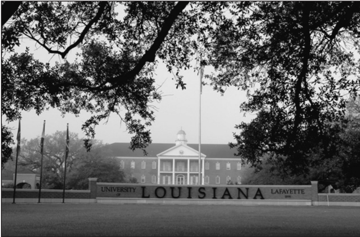
Louisiana Welcome Wall