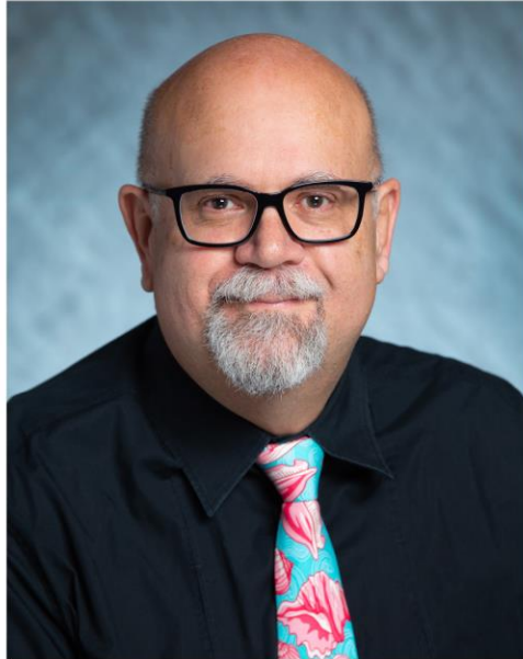
Dr. Thomas Cline College of the Arts