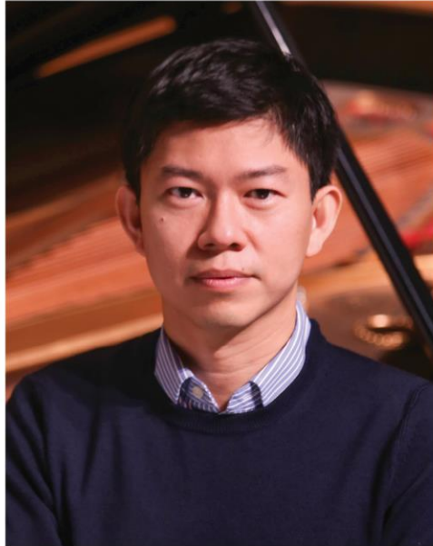
Dr. Chan Kiat Lim College of the Arts