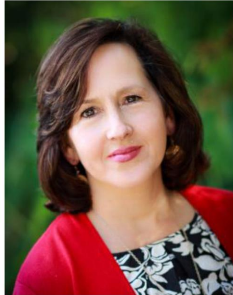
Dr. Frances Stueben College of Nursing & Health Sciences