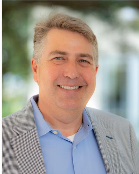
Mr. W. Geoff Gjertson Distinguished Professor Award