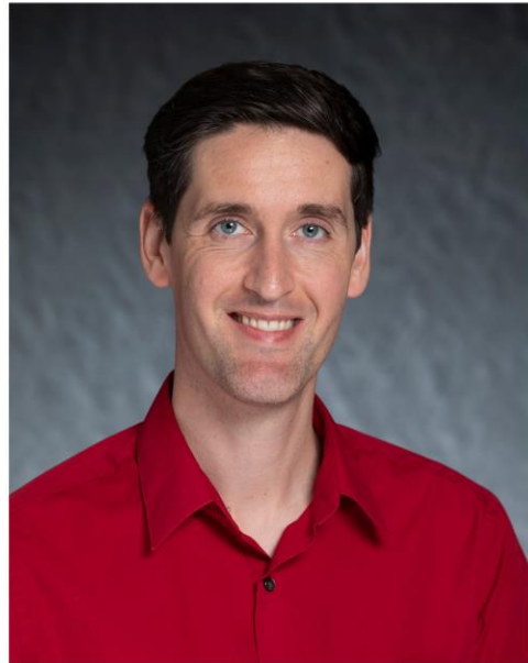
Dr. Wesley Bradford College of the Arts